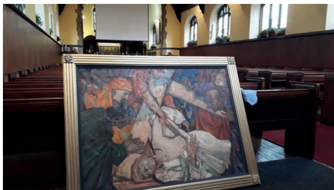
Sir Frank Brangwyn