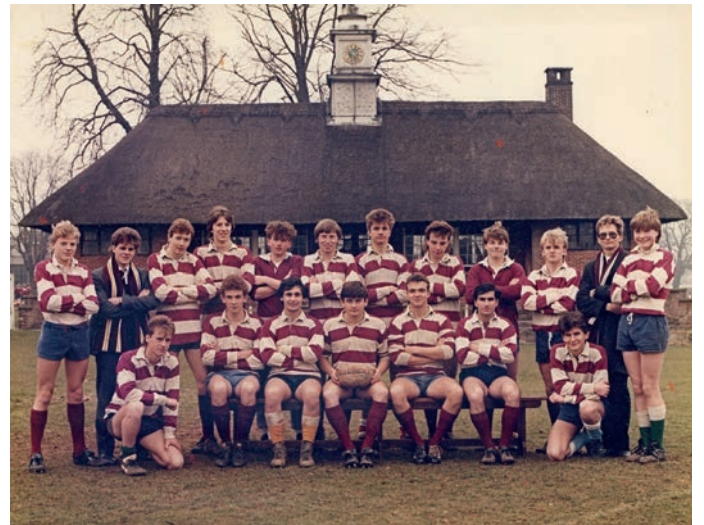
2nd XV Rugby, 1985