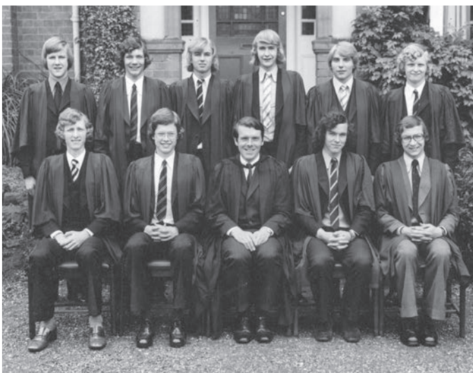
School Prefects, 1973-1974