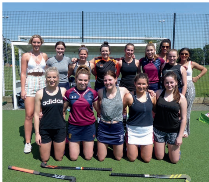
OW Hockey XI, 2019

Various OW sporting fixtures took place between last year's OW Newsletter appearing and the outbreak of the Virus, ranging from the OW -v- School cricket and hockey matches last June to the regular programme of golf and shooting fixtures.