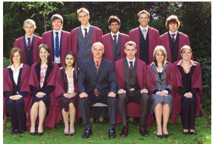
School Prefects, 2005