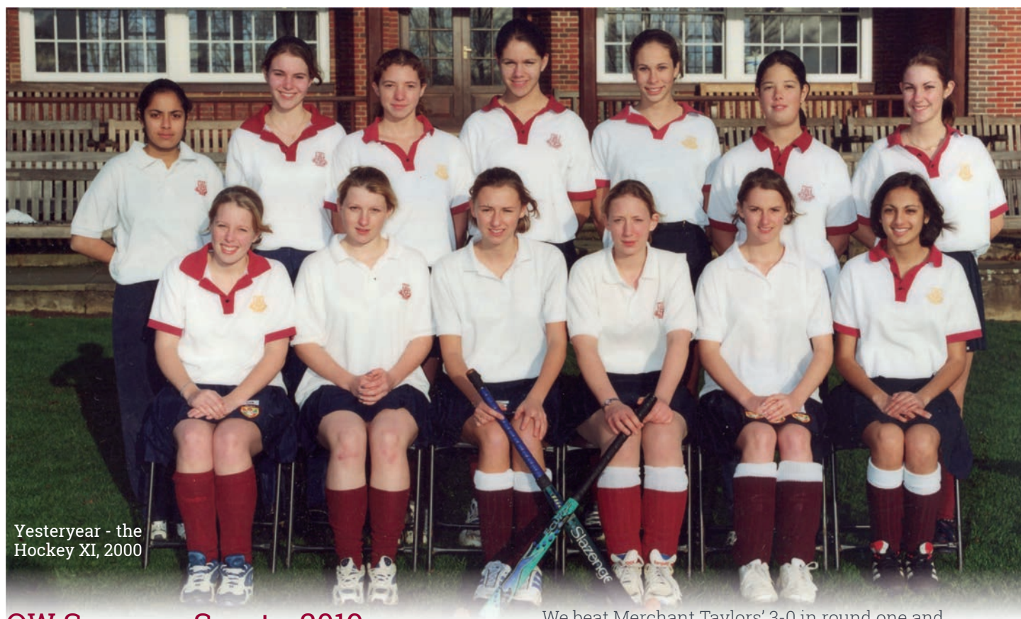
Yesteryear - the Hockey XI, 2000