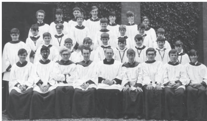
Chapel Choir, 1968