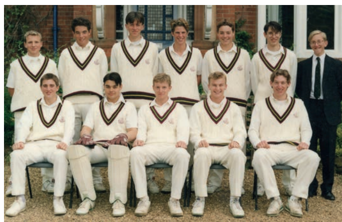
Yesteryear - the Cricket XI, 1995