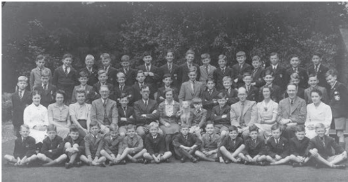
The Junior School Boarders, 1946