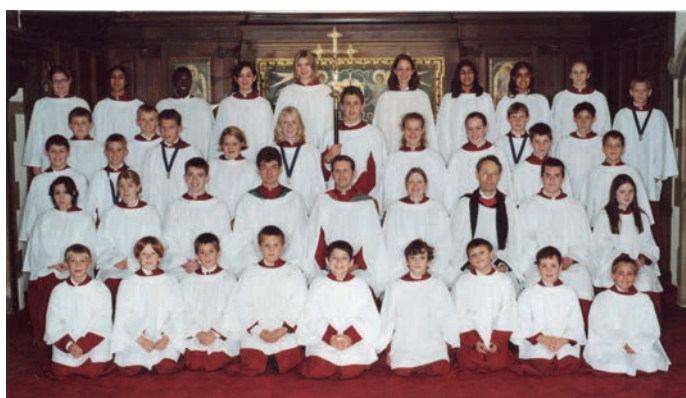
Chapel Choir, 2003