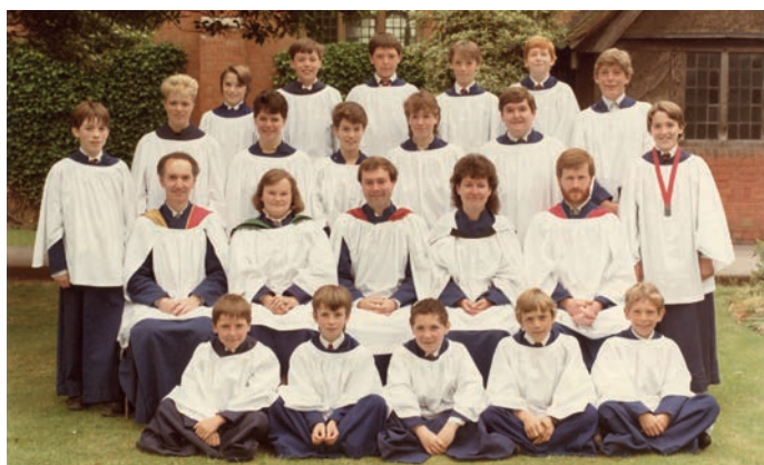
Chapel Choir, 1986