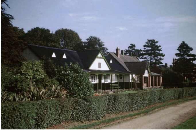
The San, 1954