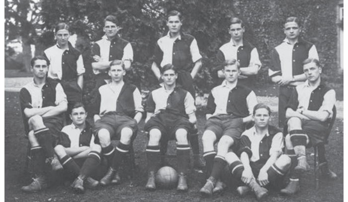
1st XI Football, 1929