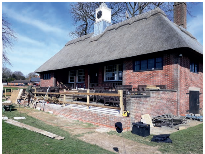
The Thatched Pavilion being refurbished