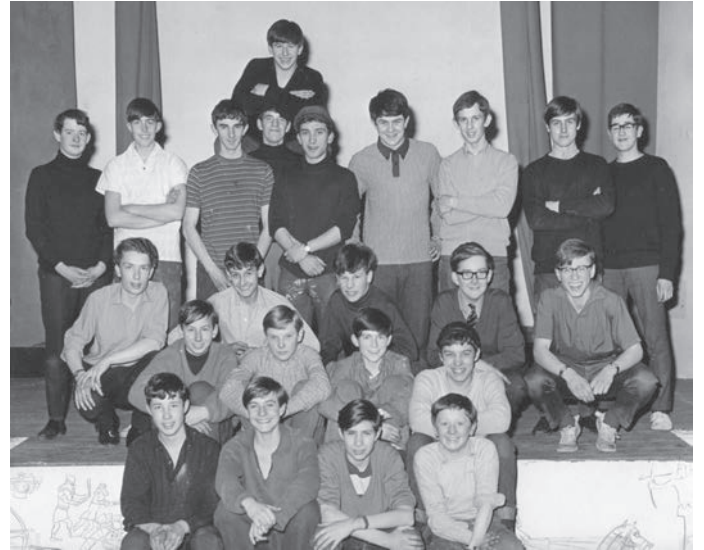
The Stage Hands, late 1960s