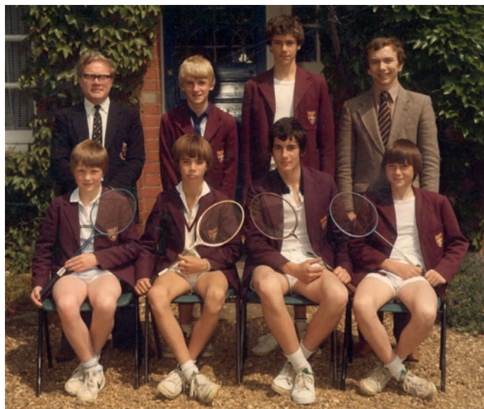
The Junior School Tennis VI, 1981