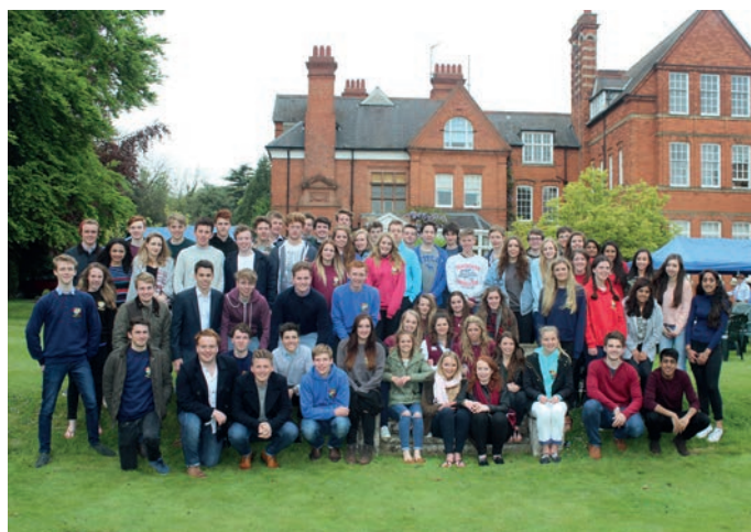
The Class of 2015

Apologies to the 2015 Leavers for the fact that we have been unable to hold your Five-Year Reunion this year. We are planning to re-arrange this for the Family of Schools Day in the summer of 2021.