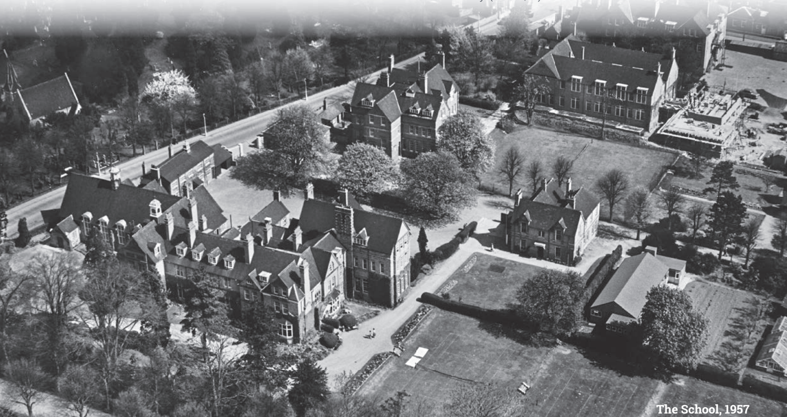
The School, 1957