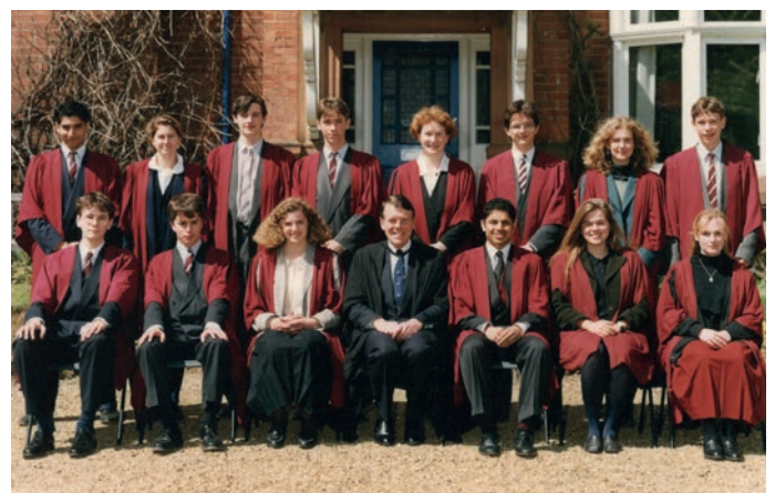
School Prefects, 1992-1993