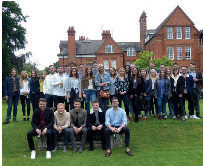
The Class of 2014

June 2019 saw the Class of 2014 back at the School for their Five-Year Reunion, where they had the opportunity to catch up with friends and their old teachers, and see who is ageing well and who isn't.